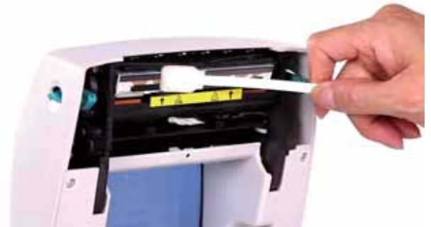
Thermal Print Head Cleaning with Self-saturated Foam Swab

Thermal Print Head Cleaning with Pre-saturated Clean Swab