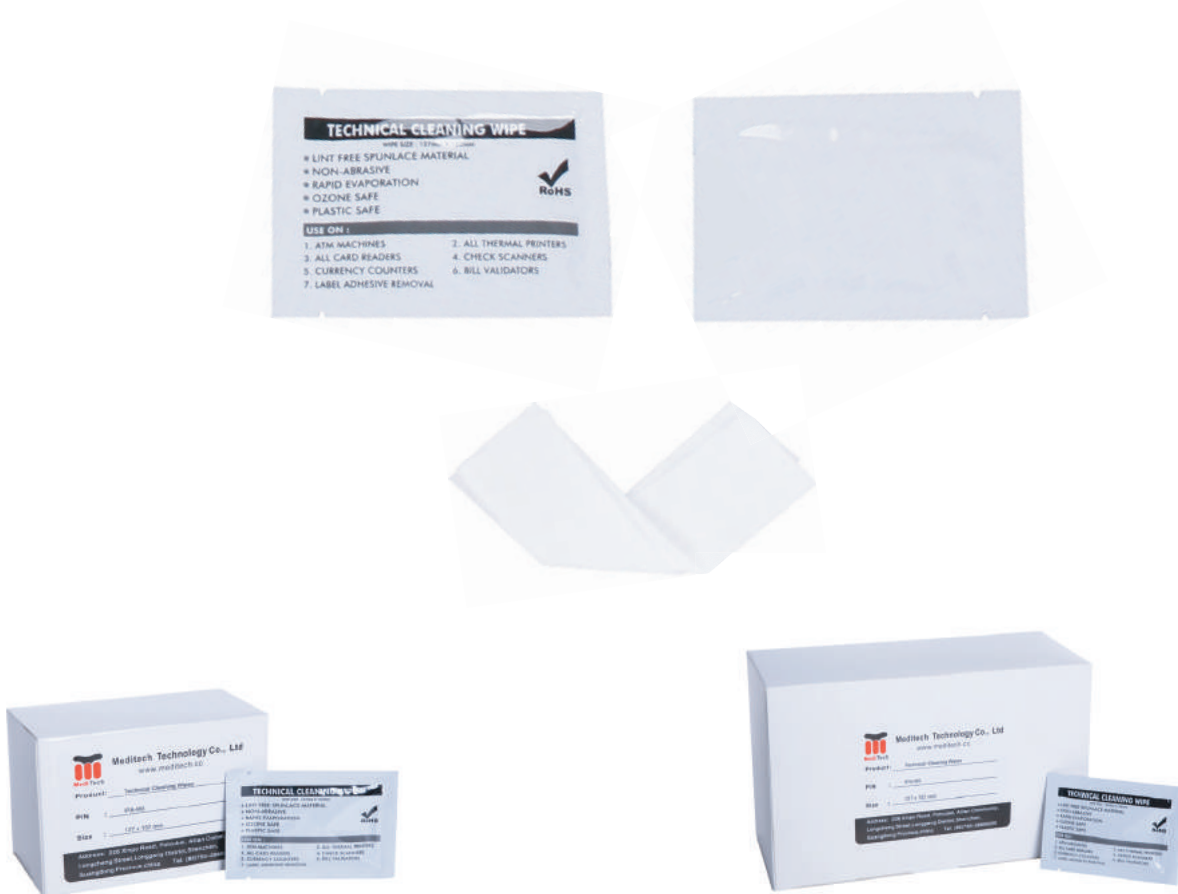
Technical Cleaning Wipes Packaging : 40 pieces per box

The dry wipe is then used to wipe and polish the screen.